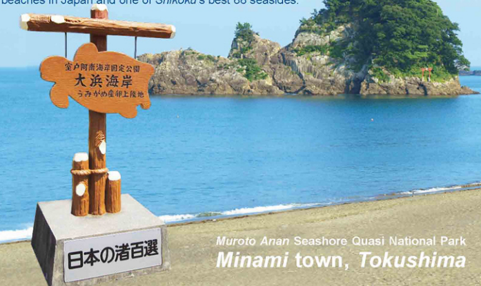
Muroto Anan Seashore Quasi National Park Minami town, Tokushima

It is widely known as a loggerhead sea turtle egg laying place. Also, it is famous as an aesthetic landscape displaying the characteristics of a tropical seaside and was chosen as one of the top 100 beaches in Japan and one of Shikoku's best 88 seascides.